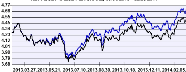
NET ASSET VALUE PER SHARE, 03/01/2013 - 02/28/2014

— AEGON Central European Equity Fund institutional series — Benchmark