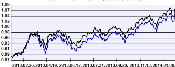
NET ASSET VALUE PER SHARE, 02/01/2013 - 01/31/2014

— AEGON International Equity Fund HUF series — Benchmark