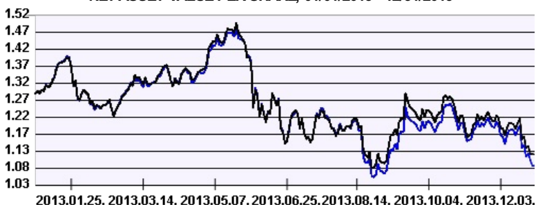
NET ASSET VALUE PER SHARE, 01/01/2013 - 12/31/2013