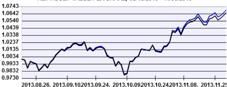
NET ASSET VALUE PER SHARE, 08/15/2013 - 11/30/2013

— AEGON International Equity Fund institutional series — Benchmark