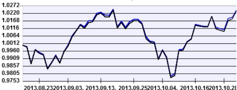
NET ASSET VALUE PER SHARE, 08/15/2013 - 10/31/2013

— AEGON International Equity Fund institutional series — Benchmark