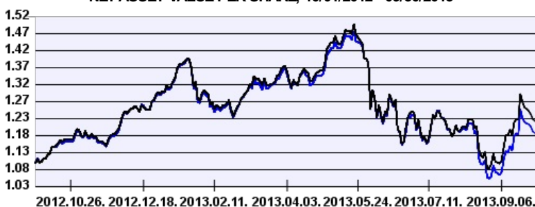
NET ASSET VALUE PER SHARE, 10/01/2012 - 09/30/2013

— AEGON Istanbul Equity Fund TRY series — Benchmark