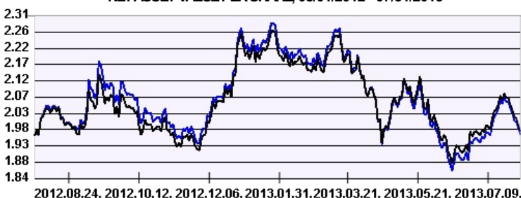
NET ASSET VALUE PER SHARE, 08/01/2012 - 07/31/2013

— AEGON Russia Equity Fund HUF series — Benchmark