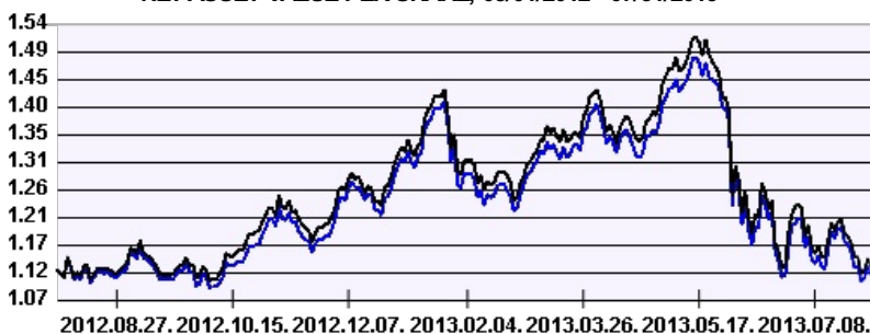
NET ASSET VALUE PER SHARE, 08/01/2012 - 07/31/2013

— AEGON IstanBull Equity Fund PLN series — Benchmark