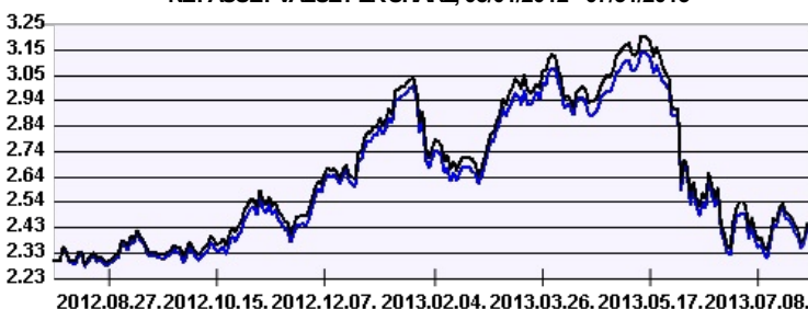
NET ASSET VALUE PER SHARE, 08/01/2012 - 07/31/2013

— AEGON Istanbul Equity Fund HUF series — Benchmark