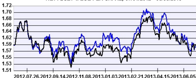
NET ASSET VALUE PER SHARE, 07/01/2012 - 06/30/2013

Past performance is no guarantee of future results. This report should not be considered as an offer or investment advisory. The Fund Prospectus contains the detailed conditions of the investment. The distribution costs of the fund purchase can be found at the distributors.