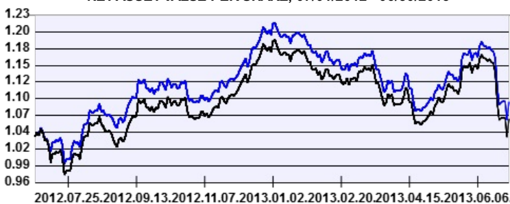
NET ASSET VALUE PER SHARE, 07/01/2012 - 06/30/2013

— AEGON Polish Equity Fund institutional series — Benchmark