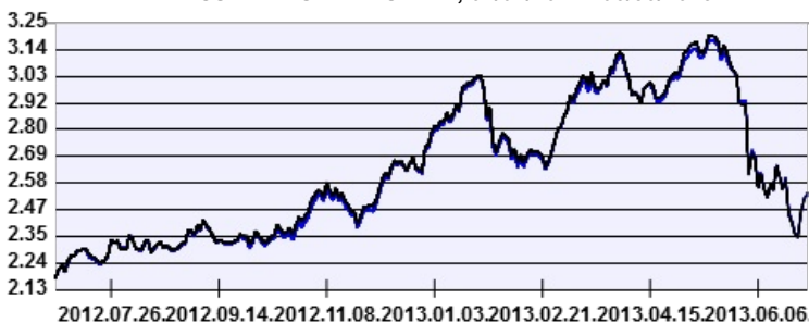
NET ASSET VALUE PER SHARE, 07/01/2012 - 06/30/2013

— AEGON IstanBull Equity Fund institutional series — Benchmark