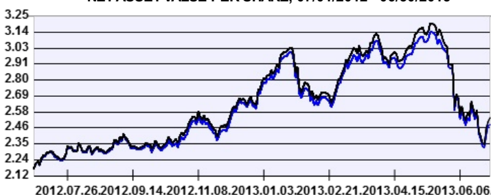
NET ASSET VALUE PER SHARE, 07/01/2012 - 06/30/2013

— AEGON Istanbul Equity Fund HUF series — Benchmark