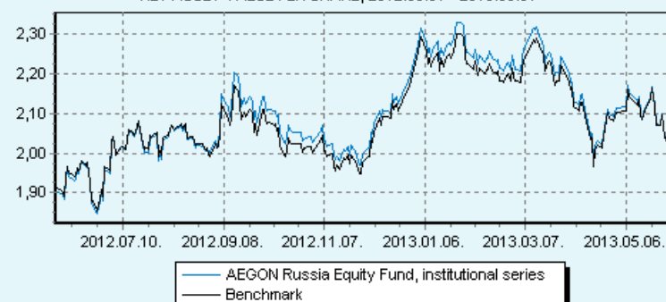
NET ASSET VALUE PER SHARE, 2012.06.01 - 2013.05.31

Past performance is no guarantee of future results. This report should not be considered as an offer or investment advisory. The Fund Prospectus contains the detailed conditions of the investment. The distribution costs of the fund purchase can be found at the distributors.