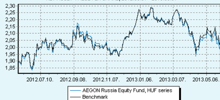
NET ASSET VALUE PER SHARE, 2012.06.01 - 2013.05.31

Past performance is no guarantee of future results. This report should not be considered as an offer or investment advisory. The Fund Prospectus contains the detailed conditions of the investment. The distribution costs of the fund purchase can be found at the distributors.