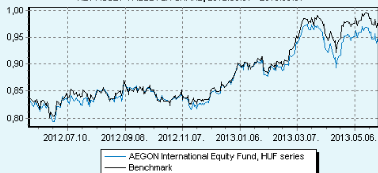
NET ASSET VALUE PER SHARE, 2012.06.01 - 2013.05.31

Past performance is no guarantee of future results. This report should not be considered as an offer or investment advisory. The Fund Prospectus contains the detailed conditions of the investment. The distribution costs of the fund purchase can be found at the distributors.