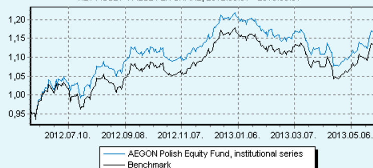
NET ASSET VALUE PER SHARE, 2012.06.01 - 2013.05.31

Past performance is no guarantee of future results. This report should not be considered as an offer or investment advisory. The Fund Prospectus contains the detailed conditions of the investment. The distribution costs of the fund purchase can be found at the distributors.