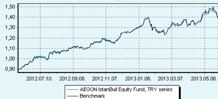
NET ASSET VALUE PER SHARE, 2012.06.01 - 2013.05.31

Past performance is no guarantee of future results. This report should not be considered as an offer or investment advisory. The Fund Prospectus contains the detailed conditions of the investment. The distribution costs of the fund purchase can be found at the distributors.