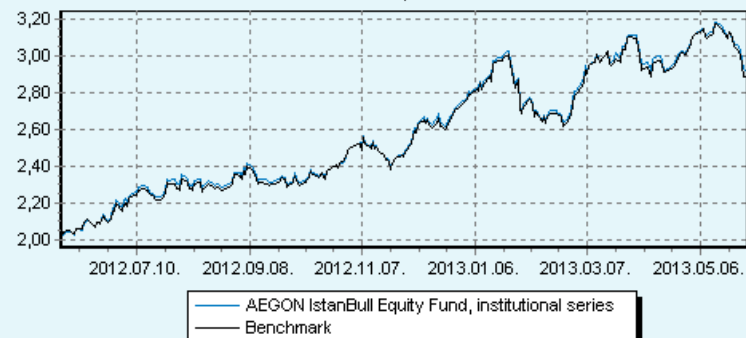
NET ASSET VALUE PER SHARE, 2012.06.01 - 2013.05.31

Past performance is no guarantee of future results. This report should not be considered as an offer or investment advisory. The Fund Prospectus contains the detailed conditions of the investment. The distribution costs of the fund purchase can be found at the distributors.