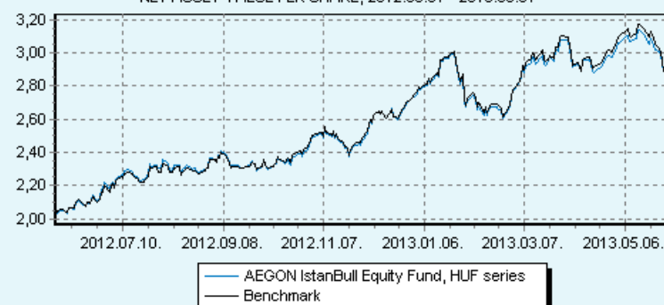
NET ASSET VALUE PER SHARE, 2012.06.01 - 2013.05.31

Past performance is no guarantee of future results. This report should not be considered as an offer or investment advisory. The Fund Prospectus contains the detailed conditions of the investment. The distribution costs of the fund purchase can be found at the distributors.