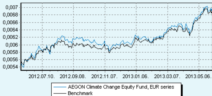
NET ASSET VALUE PER SHARE, 2012.06.01 - 2013.05.31