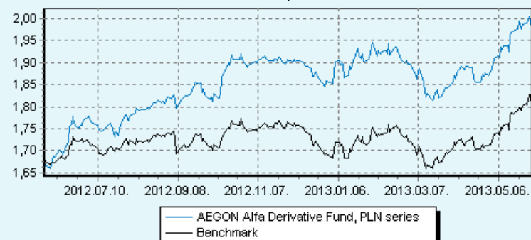
NET ASSET VALUE PER SHARE, 2012.06.01 - 2013.05.31

Past performance is no guarantee of future results. This report should not be considered as an offer or investment advisory. The Fund Prospectus contains the detailed conditions of the investment. The distribution costs of the fund purchase can be found at the distributors.