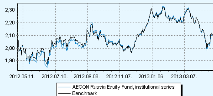
NET ASSET VALUE PER SHARE, 2012.05.01 - 2013.04.30