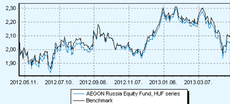
NET ASSET VALUE PER SHARE, 2012.05.01 - 2013.04.30

Past performance is no guarantee of future results. This report should not be considered as an offer or investment advisory. The Fund Prospectus contains the detailed conditions of the investment. The distribution costs of the fund purchase can be found at the distributors.