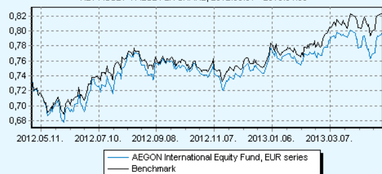
NET ASSET VALUE PER SHARE, 2012.05.01 - 2013.04.30

Past performance is no guarantee of future results. This report should not be considered as an offer or investment advisory. The Fund Prospectus contains the detailed conditions of the investment. The distribution costs of the fund purchase can be found at the distributors.