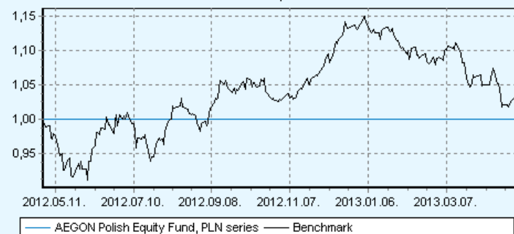
NET ASSET VALUE PER SHARE, 2012.05.01 - 2013.04.30