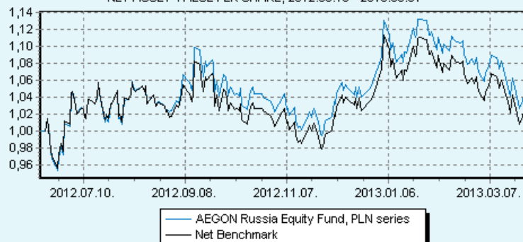
NET ASSET VALUE PER SHARE, 2012.06.15 - 2013.03.31