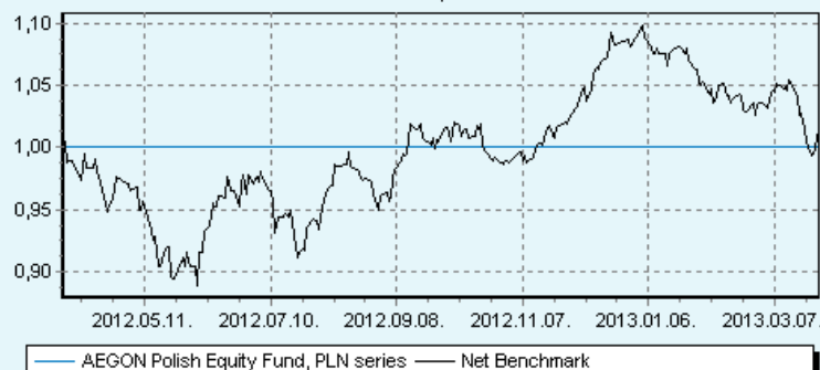
NET ASSET VALUE PER SHARE, 2012.04.01 - 2013.03.31

Past performance is no guarantee of future results. This report should not be considered as an offer or investment advisory. The Fund Prospectus contains the detailed conditions of the investment. The distribution costs of the fund purchase can be found at the distributors.