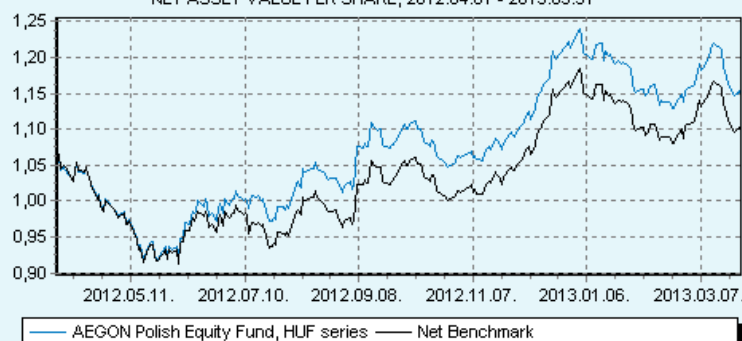
NET ASSET VALUE PER SHARE, 2012.04.01 - 2013.03.31

Past performance is no guarantee of future results. This report should not be considered as an offer or investment advisory. The Fund Prospectus contains the detailed conditions of the investment. The distribution costs of the fund purchase can be found at the distributors.