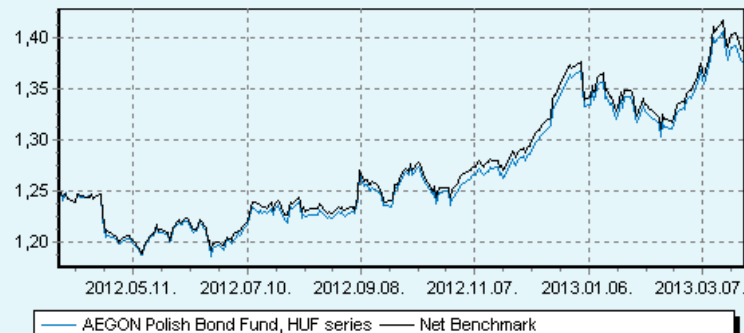
NET ASSET VALUE PER SHARE, 2012.04.01 - 2013.03.31

Past performance is no guarantee of future results. This report should not be considered as an offer or investment advisory. The Fund Prospectus contains the detailed conditions of the investment. The distribution costs of the fund purchase can be found at the distributors.