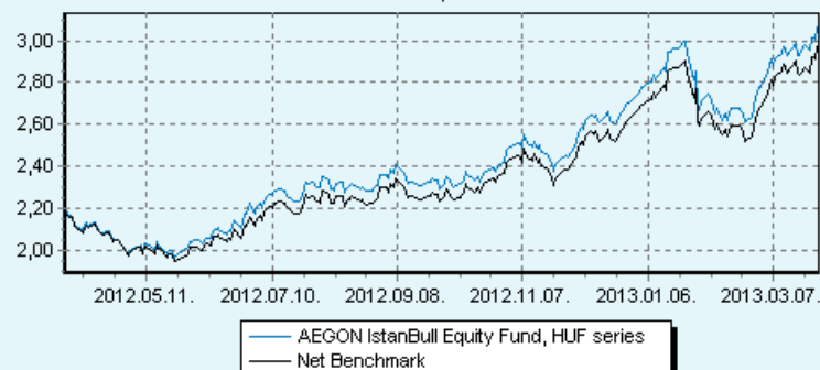
NET ASSET VALUE PER SHARE, 2012.04.01 - 2013.03.31

Past performance is no guarantee of future results. This report should not be considered as an offer or investment advisory. The Fund Prospectus contains the detailed conditions of the investment. The distribution costs of the fund purchase can be found at the distributors.