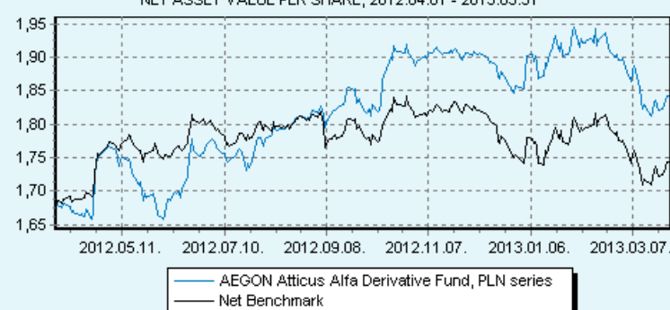
NET ASSET VALUE PER SHARE, 2012.04.01 - 2013.03.31

Past performance is no guarantee of future results. This report should not be considered as an offer or investment advisory. The Fund Prospectus contains the detailed conditions of the investment. The distribution costs of the fund purchase can be found at the distributors.