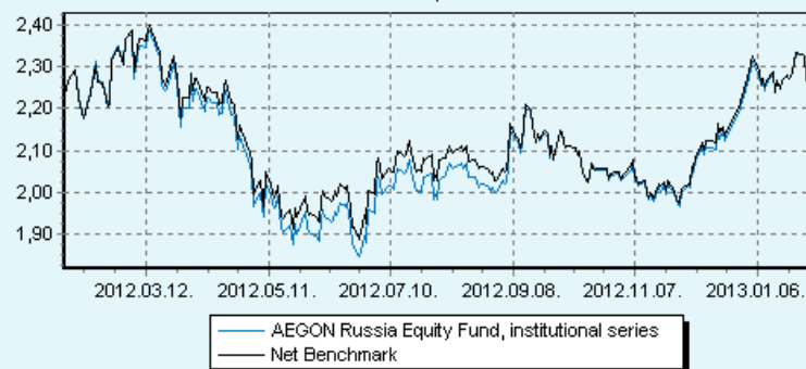
NET ASSET VALUE PER SHARE, 2012.02.01 - 2013.01.31

Past performance is no guarantee of future results. This report should not be considered as an offer or investment advisory. The Fund Prospectus contains the detailed conditions of the investment. The distribution costs of the fund purchase can be found at the distributors.