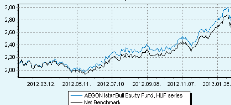
NET ASSET VALUE PER SHARE, 2012.02.01 - 2013.01.31

Past performance is no guarantee of future results. This report should not be considered as an offer or investment advisory. The Fund Prospectus contains the detailed conditions of the investment. The distribution costs of the fund purchase can be found at the distributors.