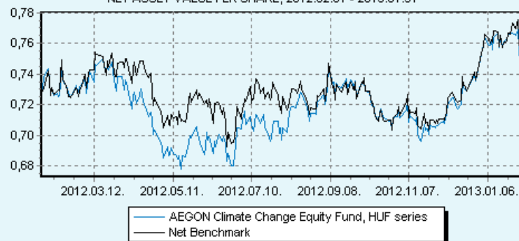
NET ASSET VALUE PER SHARE, 2012.02.01 - 2013.01.31

Past performance is no guarantee of future results. This report should not be considered as an offer or investment advisory. The Fund Prospectus contains the detailed conditions of the investment. The distribution costs of the fund purchase can be found at the distributors.