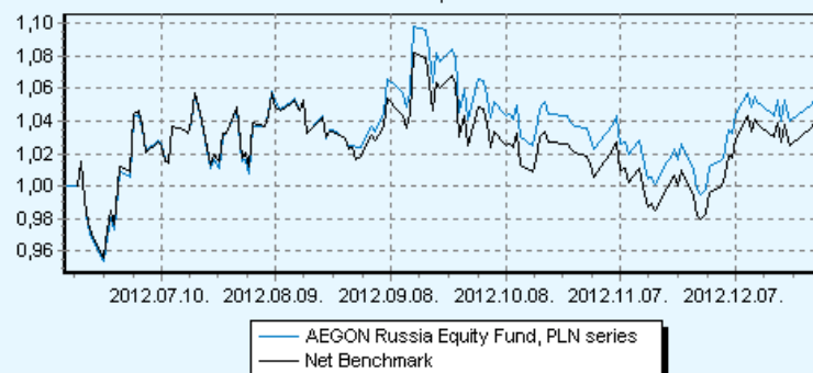
NET ASSET VALUE PER SHARE, 2012.06.15 - 2012.12.31

Past performance is no guarantee of future results. This report should not be considered as an offer or investment advisory. The Fund Prospectus contains the detailed conditions of the investment. The distribution costs of the fund purchase can be found at the distributors.