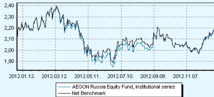
NET ASSET VALUE PER SHARE, 2012.01.01 - 2012.12.31

Past performance is no guarantee of future results. This report should not be considered as an offer or investment advisory. The Fund Prospectus contains the detailed conditions of the investment. The distribution costs of the fund purchase can be found at the distributors.