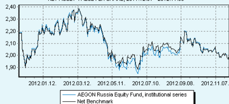
NET ASSET VALUE PER SHARE, 2011.12.01 - 2012.11.30

Past performance is no guarantee of future results. This report should not be considered as an offer or investment advisory. The Fund Prospectus contains the detailed conditions of the investment. The distribution costs of the fund purchase can be found at the distributors.