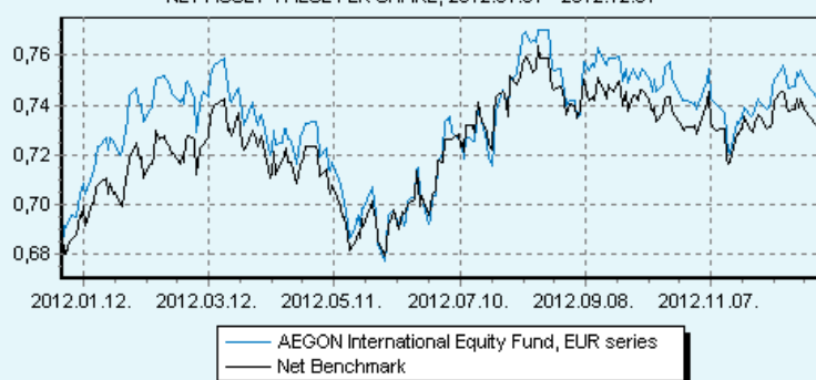
NET ASSET VALUE PER SHARE, 2012.01.01 - 2012.12.31

Past performance is no guarantee of future results. This report should not be considered as an offer or investment advisory. The Fund Prospectus contains the detailed conditions of the investment. The distribution costs of the fund purchase can be found at the distributors.