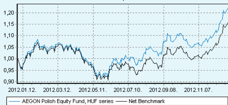
NET ASSET VALUE PER SHARE, 2012.01.03 - 2012.12.31

Past performance is no guarantee of future results. This report should not be considered as an offer or investment advisory. The Fund Prospectus contains the detailed conditions of the investment. The distribution costs of the fund purchase can be found at the distributors.