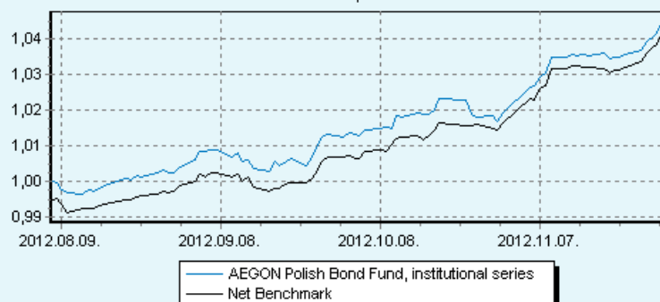
NET ASSET VALUE PER SHARE, 2012.08.07 - 2012.11.30

Past performance is no guarantee of future results. This report should not be considered as an offer or investment advisory. The Fund Prospectus contains the detailed conditions of the investment. The distribution costs of the fund purchase can be found at the distributors.