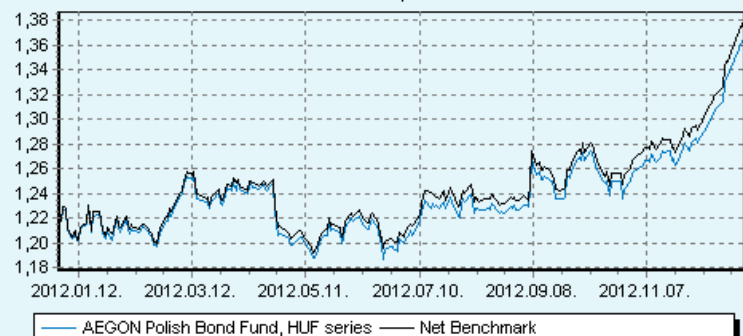
NET ASSET VALUE PER SHARE, 2012.01.01 - 2012.12.31

Past performance is no guarantee of future results. This report should not be considered as an offer or investment advisory. The Fund Prospectus contains the detailed conditions of the investment. The distribution costs of the fund purchase can be found at the distributors.