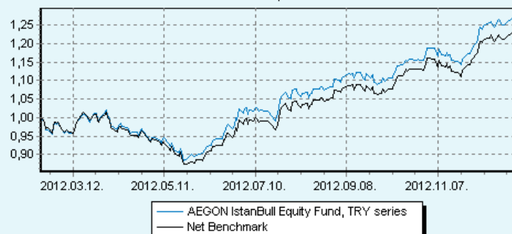
NET ASSET VALUE PER SHARE, 2012.02.20 - 2012.12.31

Past performance is no guarantee of future results. This report should not be considered as an offer or investment advisory. The Fund Prospectus contains the detailed conditions of the investment. The distribution costs of the fund purchase can be found at the distributors.