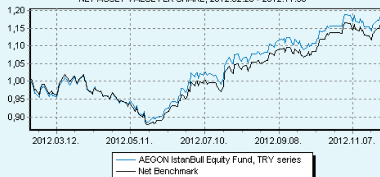
NET ASSET VALUE PER SHARE, 2012.02.20 - 2012.11.30

Past performance is no guarantee of future results. This report should not be considered as an offer or investment advisory. The Fund Prospectus contains the detailed conditions of the investment. The distribution costs of the fund purchase can be found at the distributors.