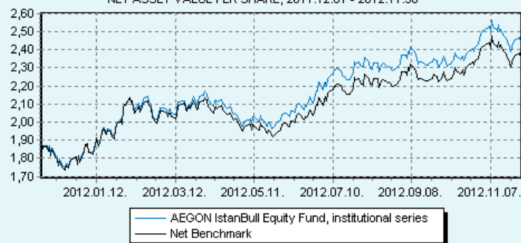
NET ASSET VALUE PER SHARE, 2011.12.01 - 2012.11.30

Past performance is no guarantee of future results. This report should not be considered as an offer or investment advisory. The Fund Prospectus contains the detailed conditions of the investment. The distribution costs of the fund purchase can be found at the distributors.