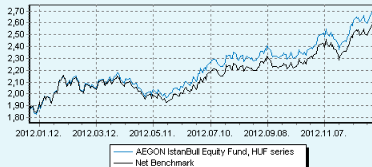
NET ASSET VALUE PER SHARE, 2012.01.01 - 2012.12.31

Past performance is no guarantee of future results. This report should not be considered as an offer or investment advisory. The Fund Prospectus contains the detailed conditions of the investment. The distribution costs of the fund purchase can be found at the distributors.