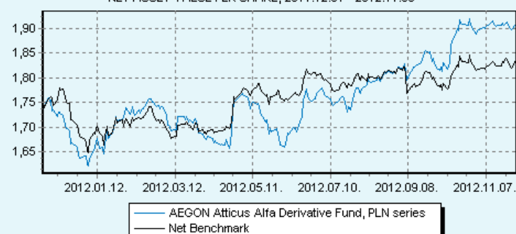
NET ASSET VALUE PER SHARE, 2011.12.01 - 2012.11.30

Past performance is no guarantee of future results. This report should not be considered as an offer or investment advisory. The Fund Prospectus contains the detailed conditions of the investment. The distribution costs of the fund purchase can be found at the distributors.