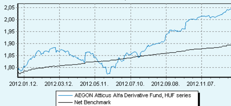
NET ASSET VALUE PER SHARE, 2012.01.01 - 2012.12.31

Past performance is no guarantee of future results. This report should not be considered as an offer or investment advisory. The Fund Prospectus contains the detailed conditions of the investment. The distribution costs of the fund purchase can be found at the distributors.