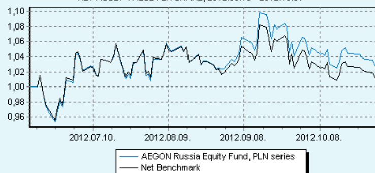
NET ASSET VALUE PER SHARE, 2012.06.15 - 2012.10.31

Past performance is no guarantee of future results. This report should not be considered as an offer or investment advisory. The Fund Prospectus contains the detailed conditions of the investment. The distribution costs of the fund purchase can be found at the distributors.