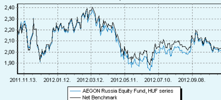
NET ASSET VALUE PER SHARE, 2011.11.01 - 2012.10.31

Past performance is no guarantee of future results. This report should not be considered as an offer or investment advisory. The Fund Prospectus contains the detailed conditions of the investment. The distribution costs of the fund purchase can be found at the distributors.